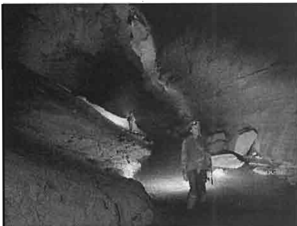
Bill in Ripple

There are two entrances side by side at the base of the cliff. One has a pipe in it and the other natural opening is the main Wild Cat Entrance that was dug