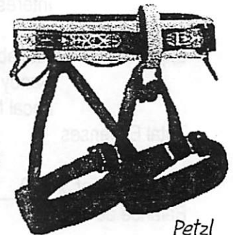
Petzl "Dionysis" Harness