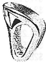
Petzl "TIBLOC" Ascender