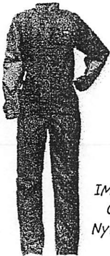
IMO "Helix" Coveralls Nylon or PVC